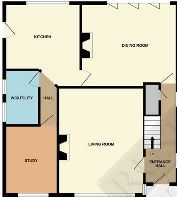
GROUND FLOOR 790 sq.ft. (73.4 sq.m.) approx.